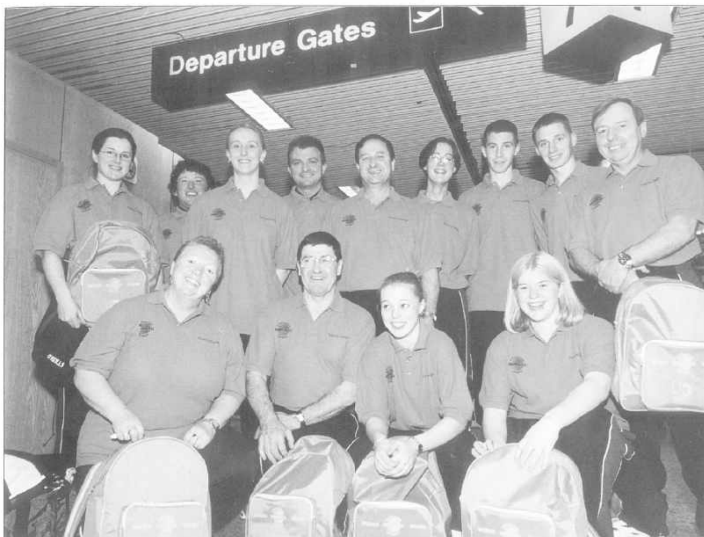
Officials and members of the Irish handball team pictured at Dublin airport before departing for the 2000 Waterford Crystal World Championships.